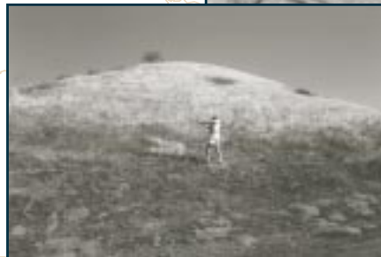
(Left) What are the odds of finding the hole on a course this large?