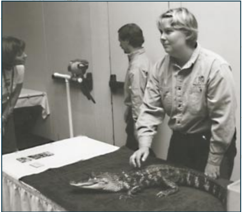
The Wednesday evening ice breaker got REALLY wild when several residents from Wildlife Safari showed up.

Since this will be a joint conference with the Washington Chapter, the conference will start on Tuesday, March 26, with a pre-conference workshop and golf. The conference will officially start Wednesday noon for a kick-off luncheon and will end at a Friday awards luncheon. Please reserve your room early at the Lodge. The Lodge phone number is 1-800-376-9116.