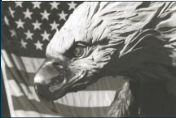
America the Beautiful at the entrance to Seven Feathers.