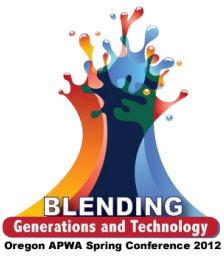
EXHIBIT AND GOLF REGISTRATION